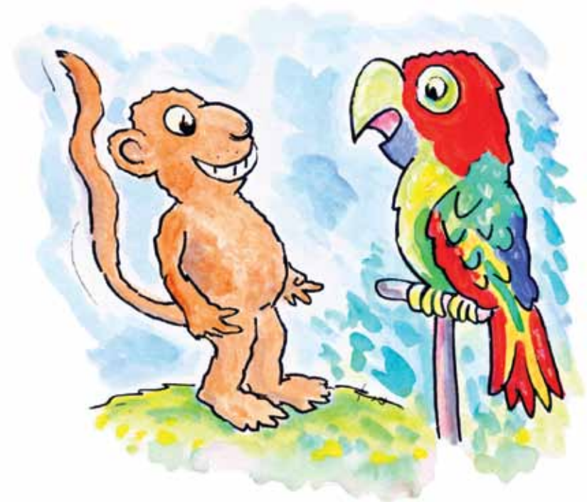
4 The right to ask for someone to repeat