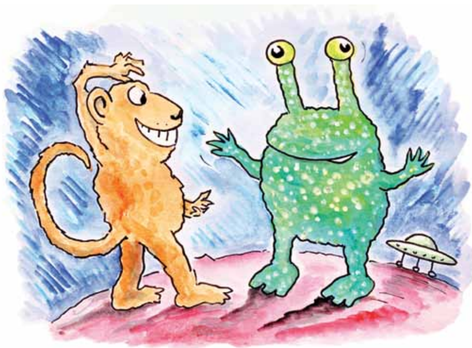
5 The right to make friends with someone who doesn't speak your language