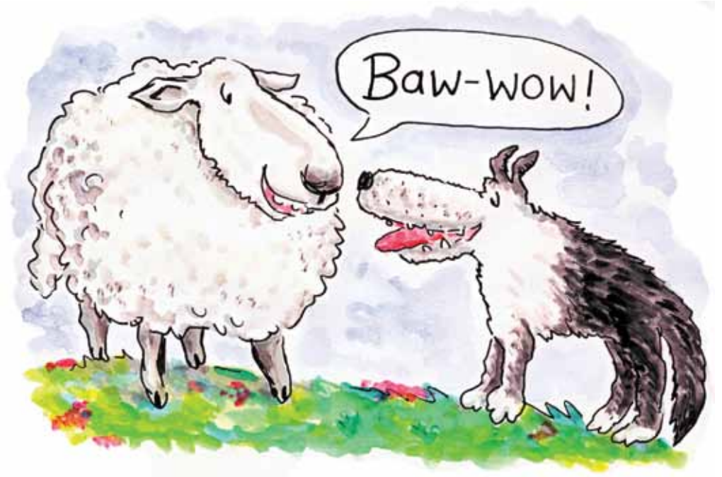
2 The right to make mistakes