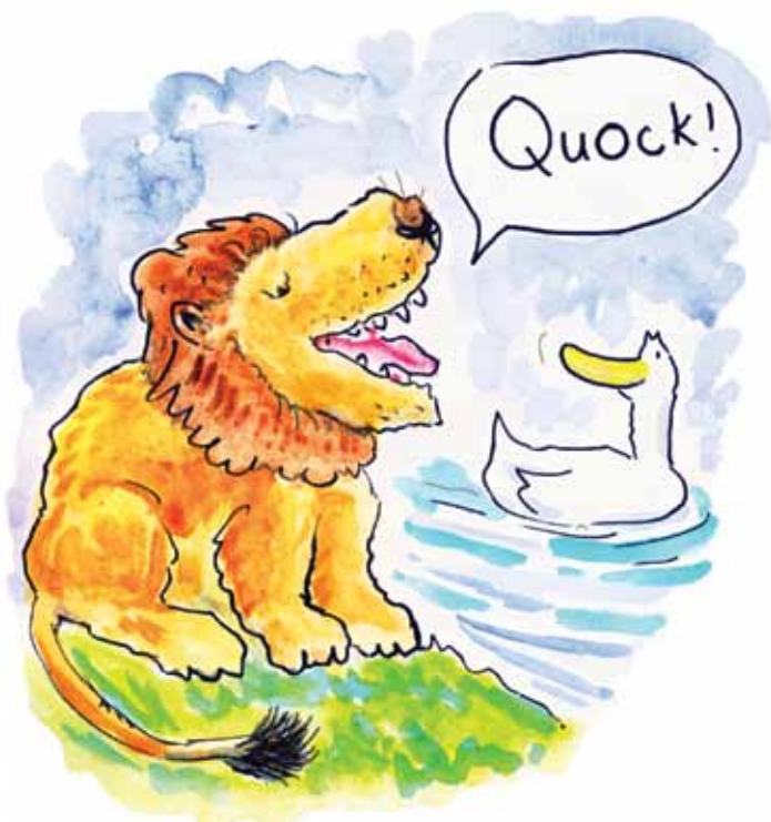
3 The right not to pronounce perfectly